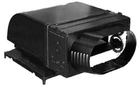
CLIP-IN EAR CONNECTED TO CUSHION HEAD ADAPTER