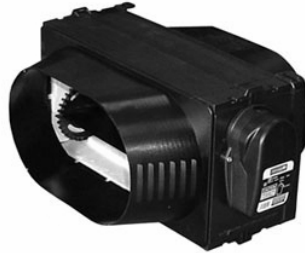
CLIP-IN EAR WITH NECK ADAPTERS